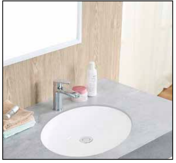
Installed Product Image

Please note: All porcelain sinks are fired at a very high temperature; final dimensions may vary slightly.