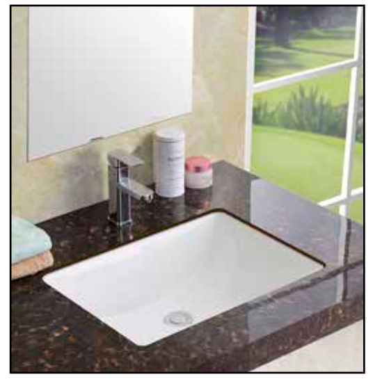
Installed Poduct Image

Please note: All porcelain sinks are fired at a very high temperature; final dimensions may vary slightly.